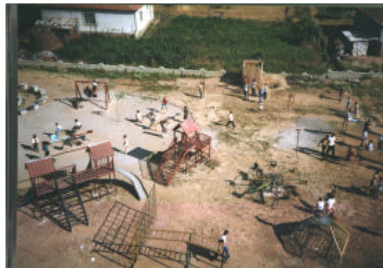
Playing in action

The ideas were presented to the Director and teachers and actions were co-ordinated with CCF. Construction works were done either by involving community groups or by hiring specialised local workers. Through a modest ceremony the playground was transferred to the school, but more effort is to be given to organising teachers and children in maintaining and protecting the space. There are 2,200 children that use the upgraded facilities. The intervention gave incentives to other NGOs to work and invest there. The playground is 1,700 m 2 and has a place for meetings, several playing appliances, sport facilities and greenery. Upon request of the teachers the fence and entrance gate of the school were also improved. It is important to notice the participatory way in which the playground was built. For example all actions were consulted with teachers and other NGOs. Youth groups painted appliances and sport equipment, including planting the greenery and watering them.