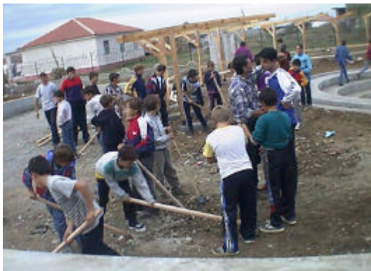
Building the playground

During the year, Co-PLAN worked regularly with the staff of the school and social animators to further improve the conditions of the playground and surrounding environment of the school. The purpose is to focus on the educational process, and to transform it to a place to be used by all, for having meetings of different community groups and social exchange.