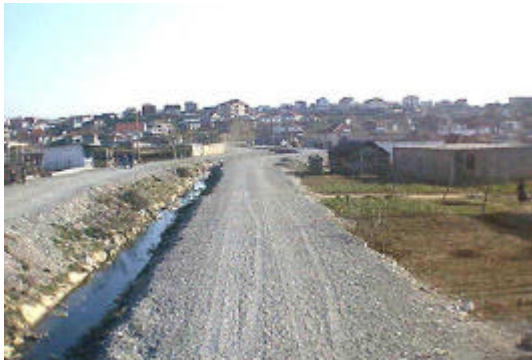
Opened and recognised public space

Between 1998-2000, around 48,000 square meters public space with a total length of 6 kilometre was opened and gravelled, out of which 2 kilometres or 16,000 m 2 was opened during 2000. Novib financed in 2000 the opening and gravelling, while Cordaid's funds were in its place transferred for building the kindergarten/ community centre. 15 public meetings were organised together with a considerable number of door-to-door visits. Around 200 families were contacted and residents have been actively involved. Almost 1.6 hectares have been released for public space. Around 50 local residents and 15 local drivers have been temporarily employed, while 480 full time working days have been offered for free by the community or local authorities. Access to the area and transport within the area is considerably improved and residents' satisfaction has clearly increased.