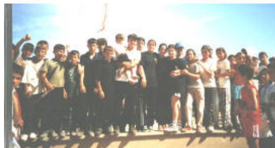
Youth getting ready for a trip

Besides, the women of Bathore have been involved in several other activities, such as: cleaning the living environment, planting trees, improving public spaces as the health care centre, school and along roads, and sewing and preparing the curtains of the Bathore school. Almost 50% of the people that participated in those actions were women. Around 40 women have been involved in preparing sweets for the children's day (1 st of June). During festivities - like the 7 th and 8 th of March (respectively the day of teachers and women) - nearly 70 women celebrated outside Bathore. Visits to the Tirana Park and the New Year's party have also been organised successfully. In addition, 100 women received counselling and advice, especially on health care, family planning and employment issues.