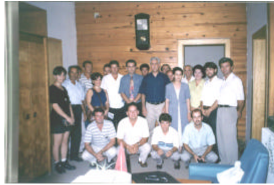
Networking in action

Some of the activities co-ordinated by the network included: