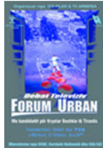
The Urban forum invitation