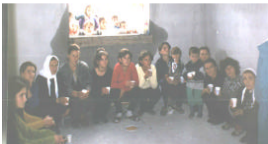
Bathore women having a meeting

Co-PLAN increased its attention on women issues during the year. In general can be said that women in Bathore are prohibited by their men to participate in public meetings, especially if these are outside Bathore. Basically, the women lack time and depend on men's decision making. In this respect, Co-PLAN strategy of intervention focused on forming, organising, supporting and training two women groups. The focus in these women groups is based on problem solving. This means that they come together to discuss cases when problems appear, and there is a need for finding solutions, rather than on a daily base.