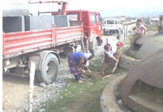
Preparing private space for public use

Co-PLAN has continuously been insisting to involve local authorities in the development process, and as a result all public spaces were planned and marked out in close collaboration with the municipal planning office. In certain cases, local authorities intervened to find legal solutions, which are acceptable for all parties, and when necessary imposed implementation of a project that was supported by a majority of the community but blocked by 1-2 families.