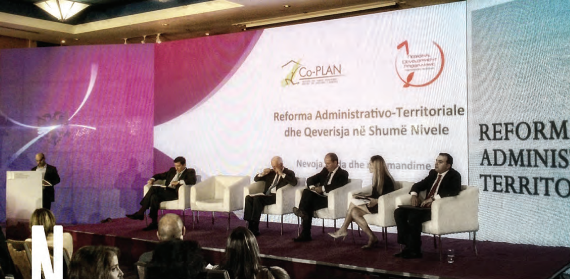
National Conference on Territorial Reform (October 17, 2013)